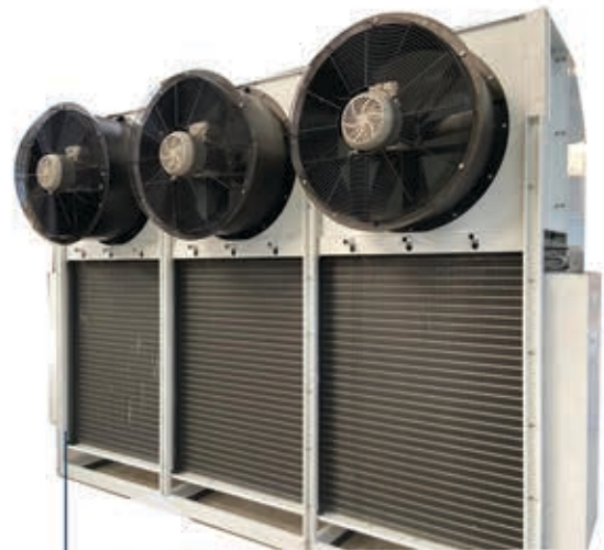
Guntner Blast Unit Cooler