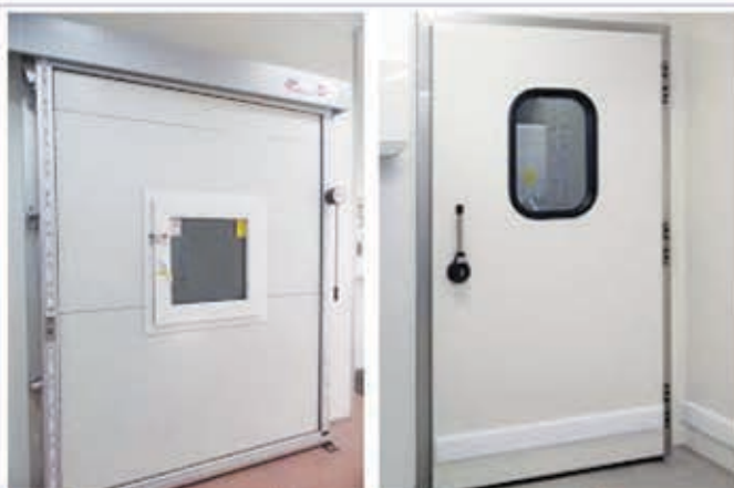
Cold Room Door