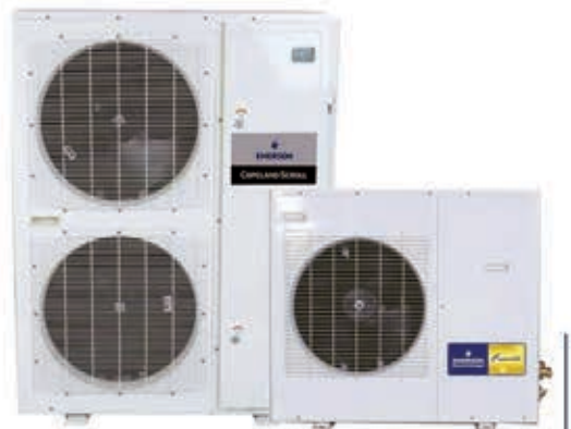
Emerson & Copeland Condensing unit