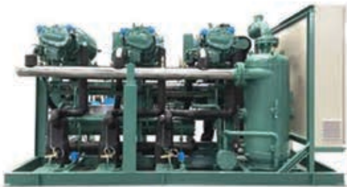
Rack System Condensing unit with Bitzer Compressor