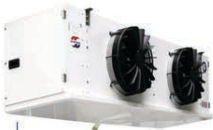
Guntner Unit Cooler