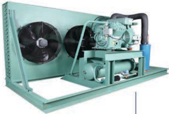
Condensing unit with Bitzer Compressor