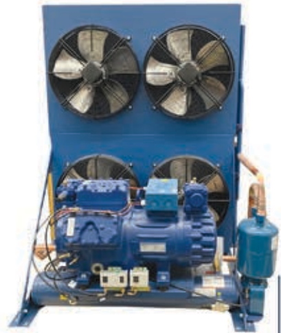
Condensing unit with Bock Compressor